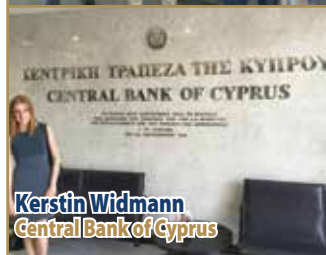
Kerstin Widmann Central Bank of Cyprus