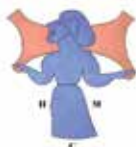
Hellenic Copper Mines