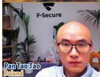
Pan Tao Tao Poland