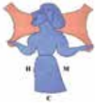
Hellenic Copper Mines